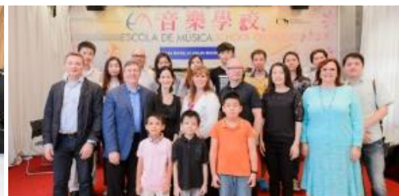
Free pop-up community concerts and master classes with members of The Philadelphia Orchestra