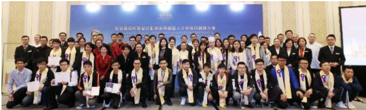
Fast Track Supervisor Programme