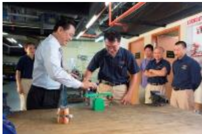
My Way Programme