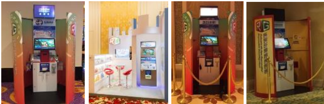
Responsible gaming booths set up across all Sands China properties