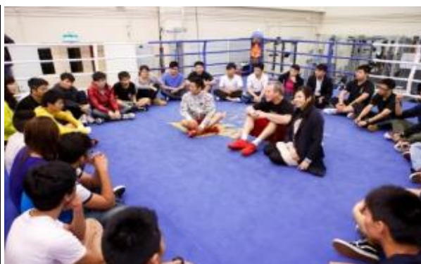
Chinese Olympic gold medalist & pro boxer Zou Shiming exchanges ideas with local boxing enthusiasts