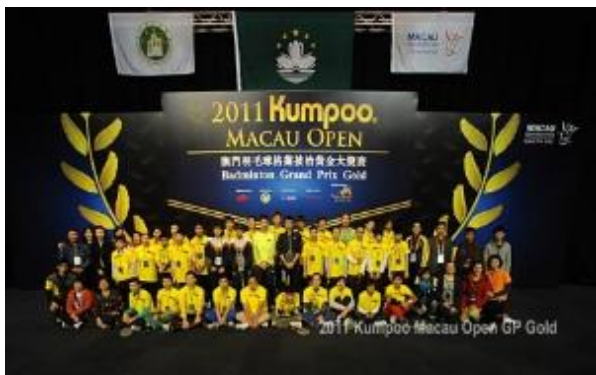
Badminton clinic for Macao Special Olympics members with badminton star Lee Chong Wei