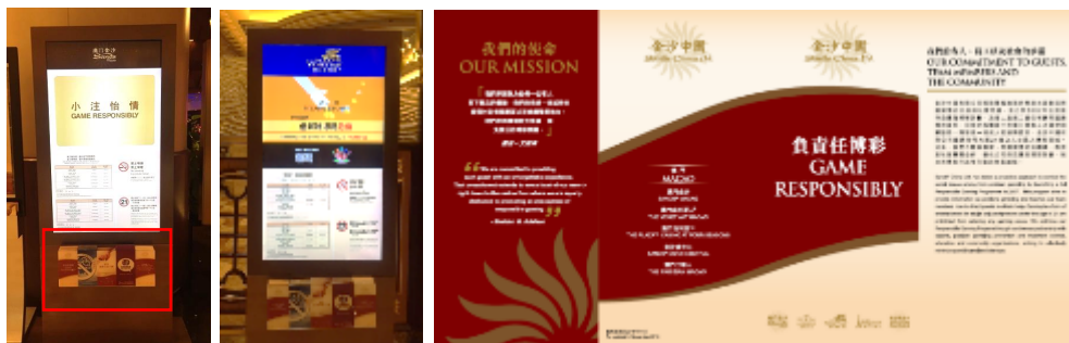
Responsible gaming leaflets available at each casino entrance