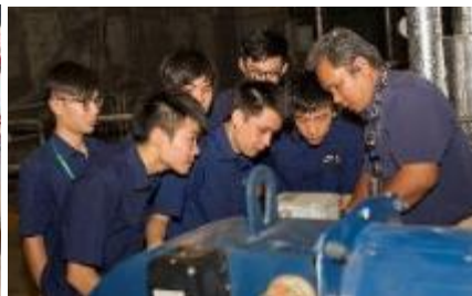
Integrated Resort Internship Programme