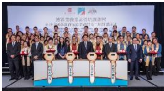
Professionalism Training for Gaming Practitioners 2019 G2E BEST CSR AWARD – SANDS CHINA LTD.