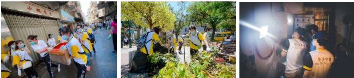
Clean up in the Macao community and providing technical assistance to inspect and repair buildings