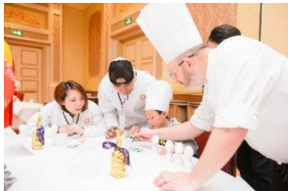
Easter egg painting activity with children and families of YMCA