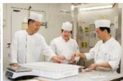
Career Experience Opportunities Programme (CEOP)