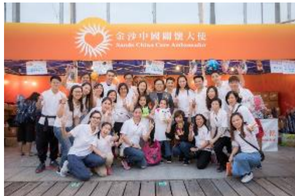
SCAs participate in the Caritas Macau Charity Bazaar by running a game booth