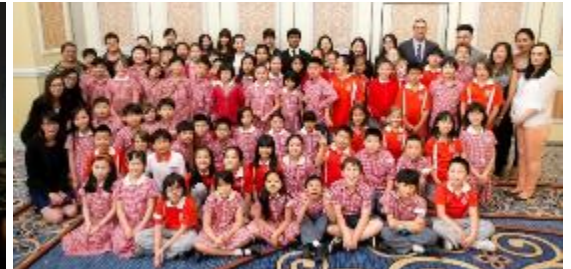
Sustainability tours for local students