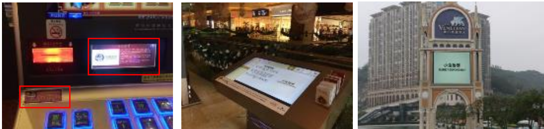
Responsible gaming info displays on various digital screens