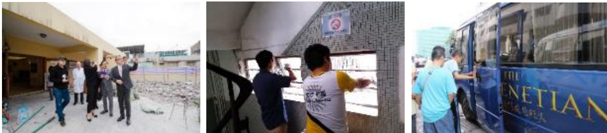
Repairing damaged homes and service centers and providing transportation support to NGOs to resume their services