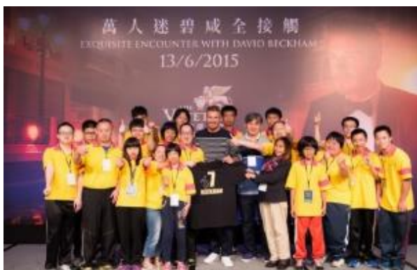
Macao Special Olympics athletes meet David Beckham, who offered them words of encouragement