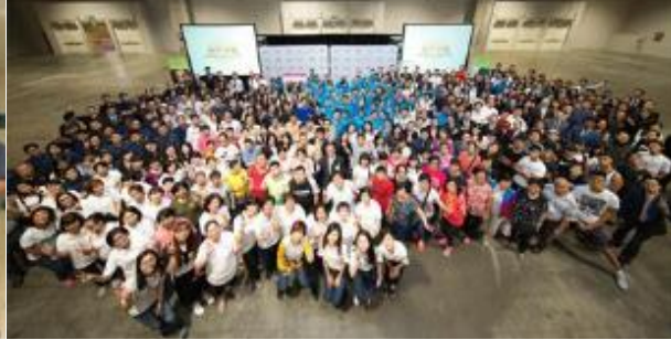
Las Vegas Sands Global Hygiene Kit Build with Clean the World