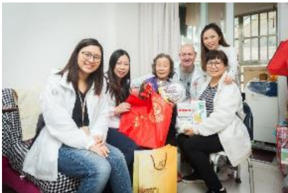
SCAs visit households at Seac Pai Van public housing in Coloane for the annual traditional Chinese custom of spring cleaning