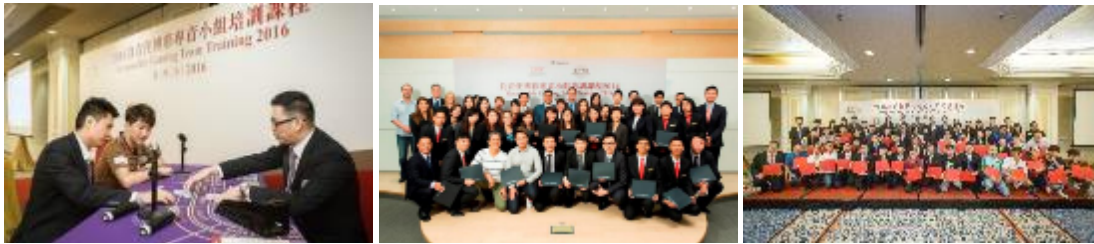
Responsible gaming ambassador training