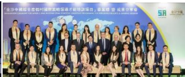
Sands China International Strategic Leadership Programme for Integrated Resorts