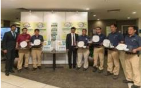
Clean Plate Challenge